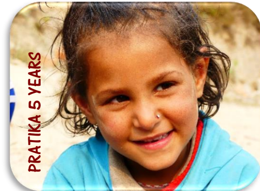
PRATIKA 5 YEARS