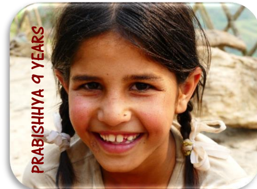
PRABISHHYA 9 YEARS

Two sisters waiting for their sponsors 😊